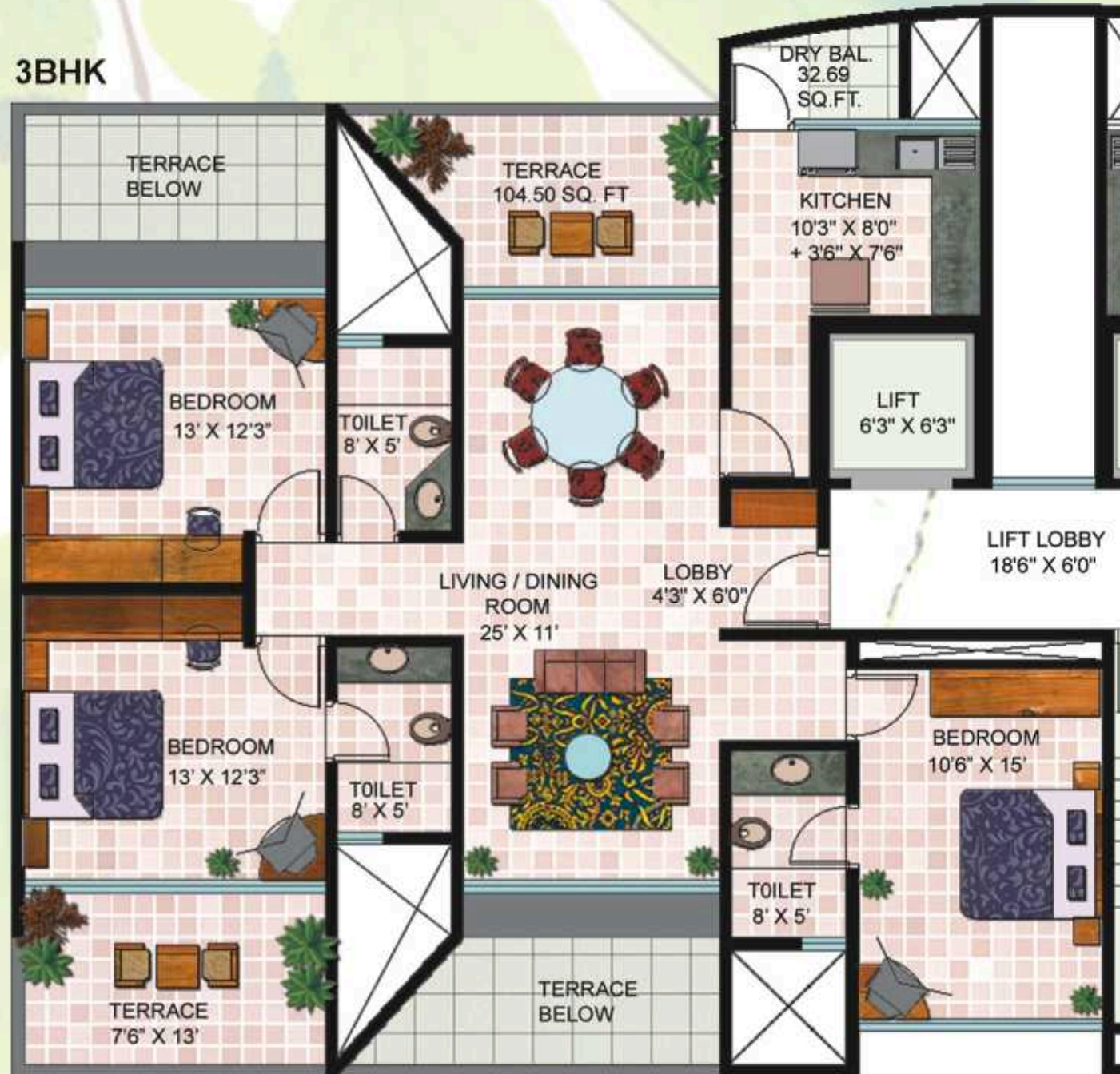
Typical Apartment Area Statement in sq.ft.